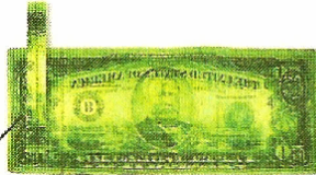
Figure D - Series 1990 through 1995